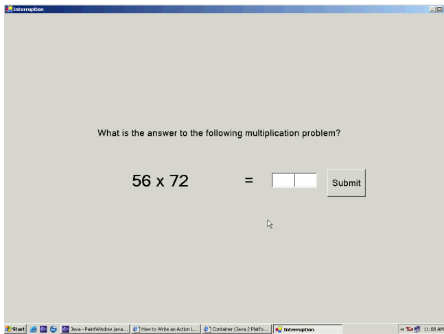
Figure 3. A mental arithmetic interruption. Note that it obscures the entire screen.

icon shown in Figure 2 notified participants of a pending interruption. Participants could choose whether to address it immediately or continue with their primary programming task until they wanted to address the interruption. In his work on techniques for coordinating interruptions, McFarlane refers to this approach as a negotiated solution, because a person is able to choose when they want to address an interruption. McFarlane found that this negotiated solution generally works best, as long as small differences in the time taken to begin addressing an interruption are not critical [21]. Robertson et al. have compared immediate and negotiated coordination of error messages when programming in a spreadsheet application, finding that task performance was significantly better with negotiated coordination [24]. This evidence that negotiated coordination is the best approach to interruptions in development environments informed our use of negotiated coordination, as we want our study to be based in how programmers handle normal interruptions. Value was associated with the interruptions by telling participants that they would lose $2 for any ignored or incorrectly answered interruption, but we did not enforce this penalty.