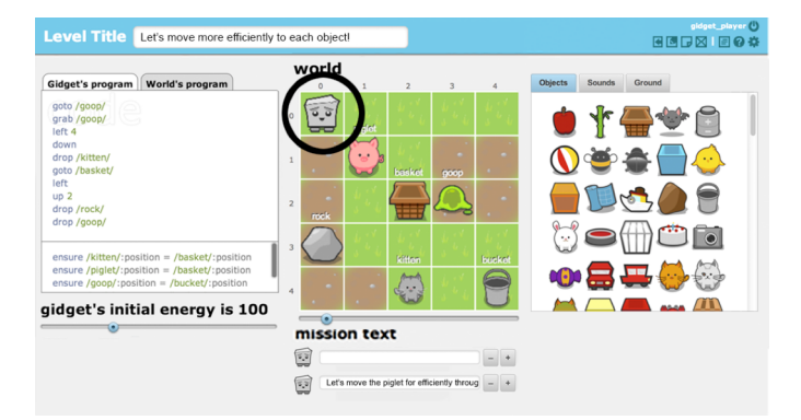
Figure 1. Gidget's level design mode (the Gidget character is circled). In this mode, learners design their own levels for others to solve. Players write code (left) that can include graphics (right), and see animated results (middle), and graphics for the level are on the right.

Oregon State University School of EECS<sup>2</sup> and STEM Academy<sup>3</sup> Corvallis, Oregon, USA